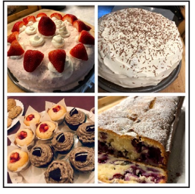
Some cakes and cookies baked by Lena. These look delicious!